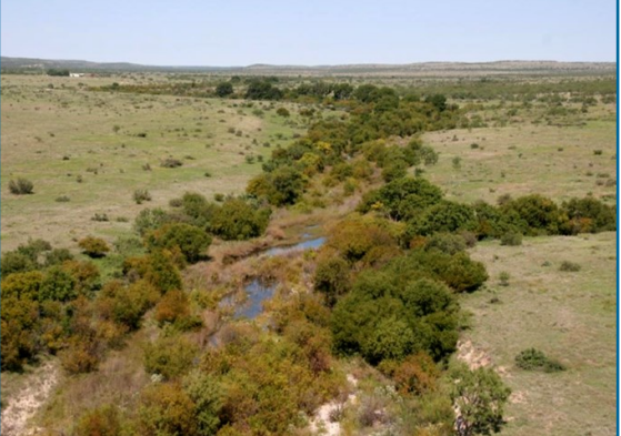
Riparian area buffer zones reduce the amount of sediment that enters streams. They also benefit wildlife by providing food, cover, travel corridors, and nesting sites.

tion, or other management activities have the potential to negatively impact soil and water resources if poorly planned or implemented. Best Management Practices (BMPs) are the principal means of protecting soil and water resources during these management activities.